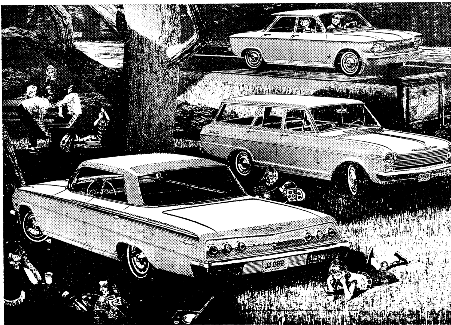
Chevrolet Impala Sport Sedan (foreground)

Not just three sizes... but three different kinds of cars... Chevrolet!